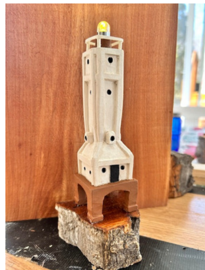
Jim's Finished Lighthouse, Base is Bark, Lighthouse is basswood, painted.