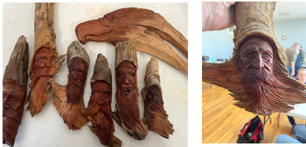
Some of the works of Lewis Holloway