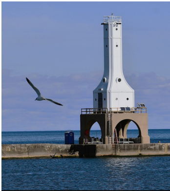
Photo of a Lighthouse near Port Washington Wisconsin where Jim Hartwigs parents lived.