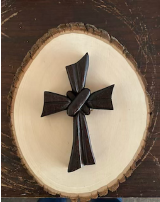
Jim Hartwig; Peruvian Black Walnut