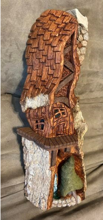
Three views from another unique John Kawalchuk bark house.

Tom Gow's quote: "I would like to see members send pictures of their carvings to the newsletter for publication. It can be your first carving or any carving you have done up to your last carving"