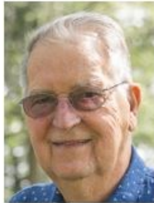
EDUCATION: DICK CARD