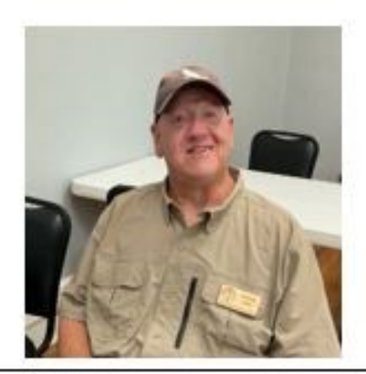
Some of the Carvers at a Wednesday night Carve-In at Mauldin