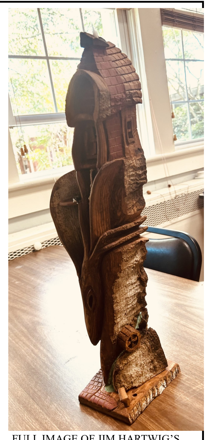
FULL IMAGE OF JIM HARTWIG'S TREE HOUSE DESCRIBED ON PREVIOUS PAGE

Since I hated to leave this space empty I put in a few pictures of 2 of Dick Card's relief projects. The top photo is of a relief attached to a back plate. The lower picture is of a challenge to Dick from Greg Wirtz,