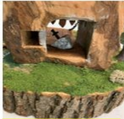
Inside you can see the STONE AND AX.