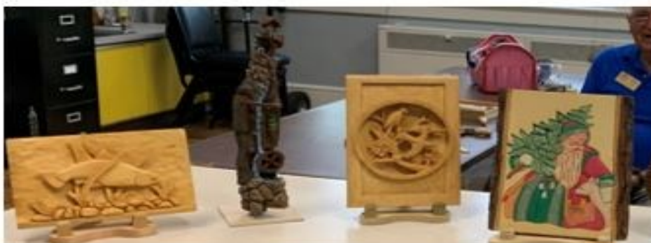
Above some pyrography and carvings of Betty Card