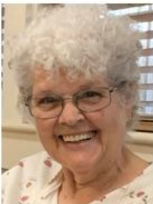
News Editor/Face Book Bettv Card