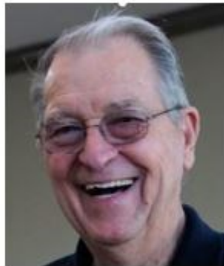
Education Dick Card